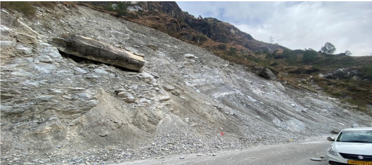
CH-445+680 – 446+090, 410m (BANERPANI)

“Construction for Mitigation Measures of 05 Nos. Land Slides, 05 Nos. Sinking Zones from Ch. 433.00 to Ch. 450.00 (17 Km. length) on NH-07 on EPC mode in the State of Uttarakhand (Package-II)”