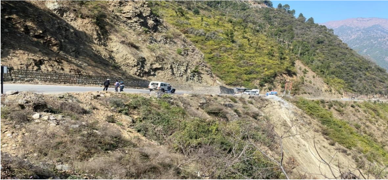
CH-386+110–386+280, 170m (KAMEDA)

“Construction for Mitigation Measures of 05 Nos. Land Slides, 05 Nos. Sinking Zones from Ch. 433.00 to Ch. 450.00 (17 km. length) on NH-07 on EPC mode in the State of Uttarakhand (Package-II)”