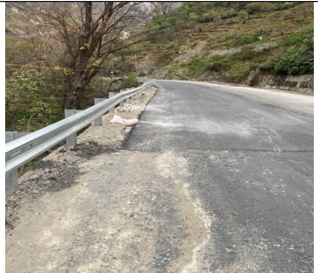
CH-439+920–440+180, 260m (GADORA)