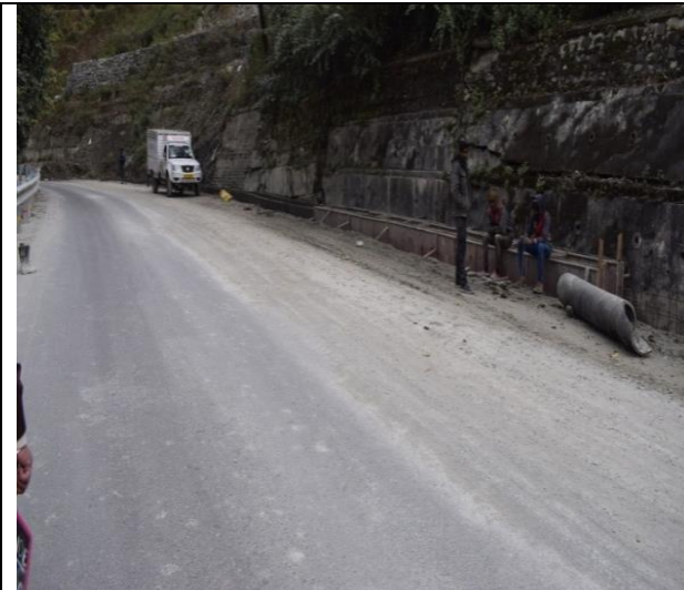
CH-434+320 – 432+400, 80m (BIRAH I)