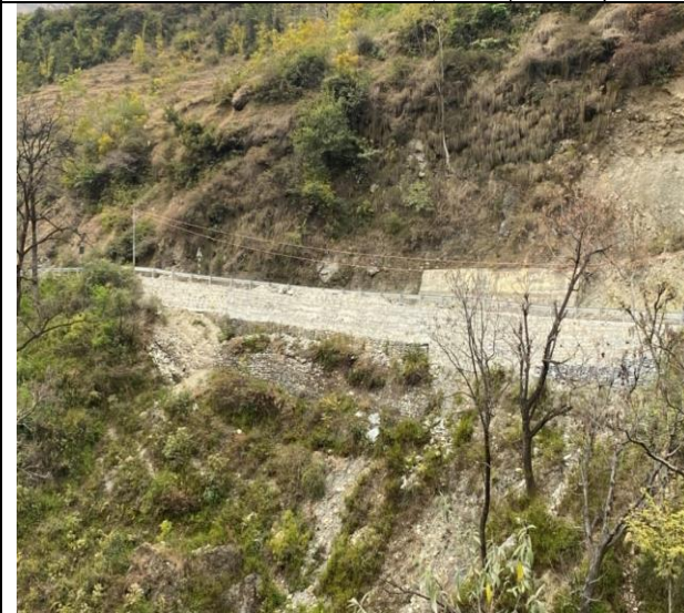
CH-440+280–440+360, 80m (GADORA)