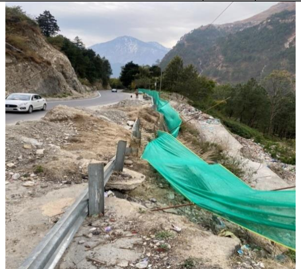
CH-445+060 – 445+130, 70m (BANERPANI)