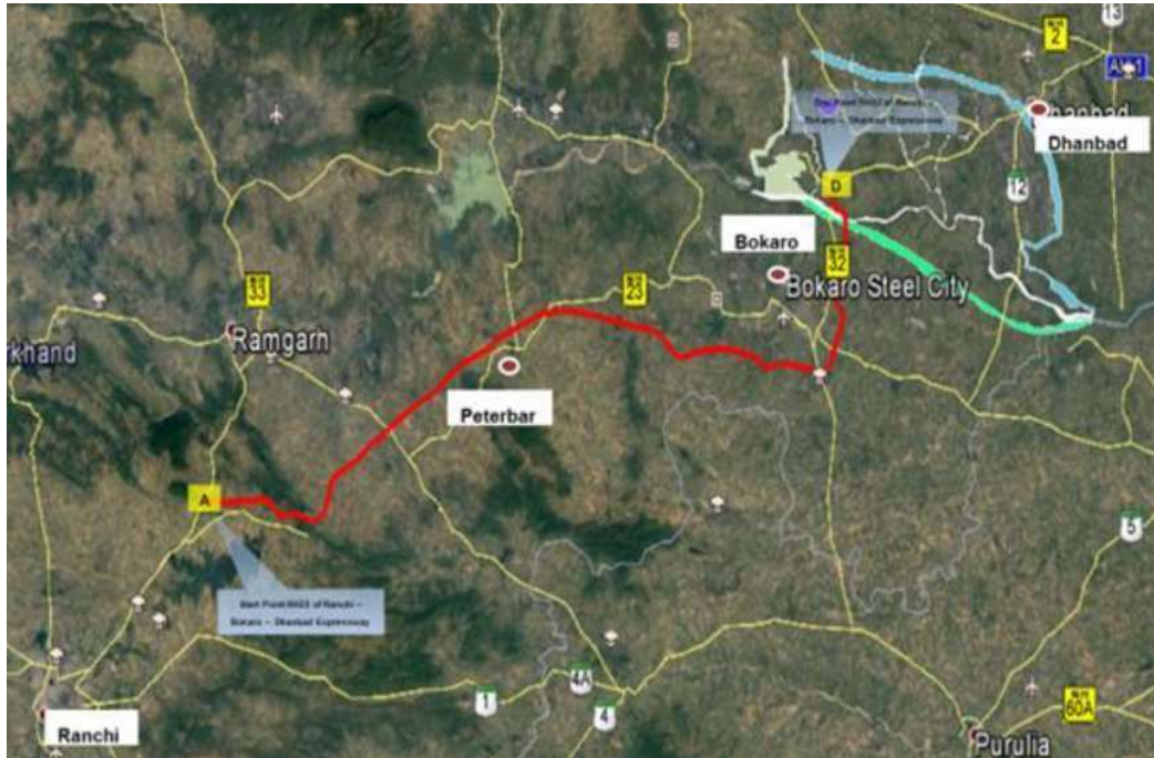
Figure 3: Map showing proposed alignment of project road

The final alignment chosen for the project in consultation with <xx, yy> will <be along current project road/ pass through xx, yy new towns- short description of alignment with changes if any>.