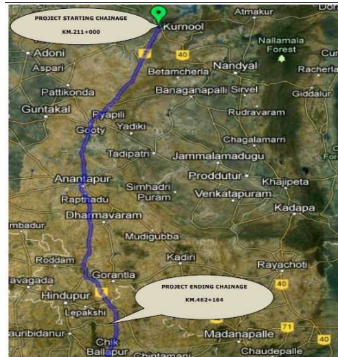
Figure 1: Location of project road

As described earlier the project road lies on NH xx (previously NH yy) and connects <origin> with <destination>, passing through the states of <state 1, state 2>. The proposed project alignment passes through <towns/junctions a, b, c, d> for a total length of <xx km>.